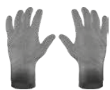
Gloves with Clim8® technology inside